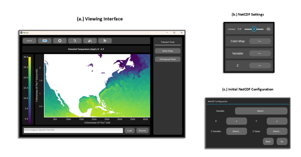
Figure 1: a.) The viewing interface shown with a NetCDF4 file of ocean temperature in the Gulf Stream region. b.) The setting options for NetCDF files. c.) The initial configuration menu for loading NetCDF4 files.