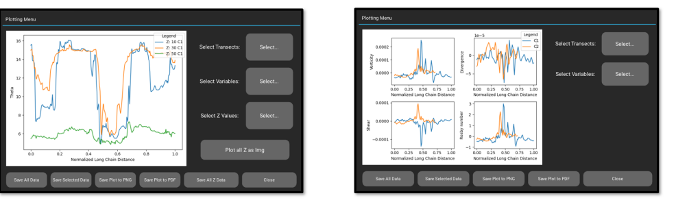
Figure 3: a.) A plot of a single 'Inline Chain' drawn over a feature plotted at multiple values along the z dimension. b.) A plot of two 'Inline Chains' taken over various variables in the NetCDF4 file.